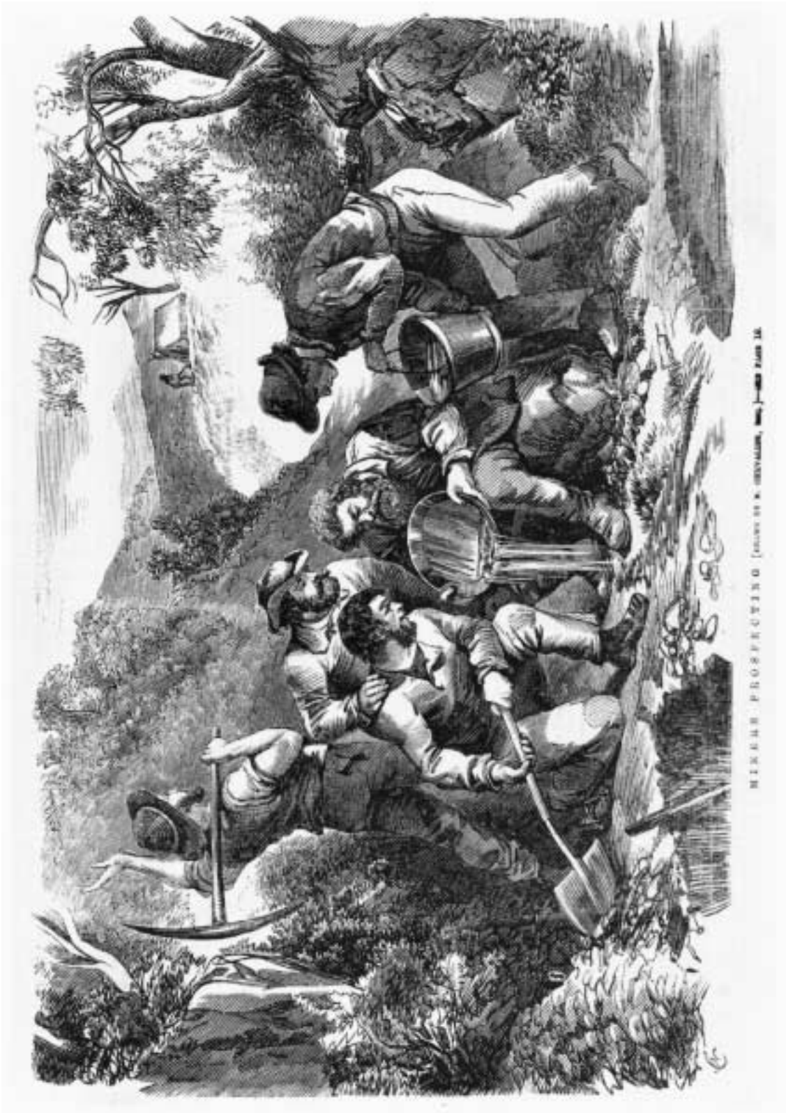
Nicholas CHEVALIER Miners Prospecting , 1864 Wood engraving