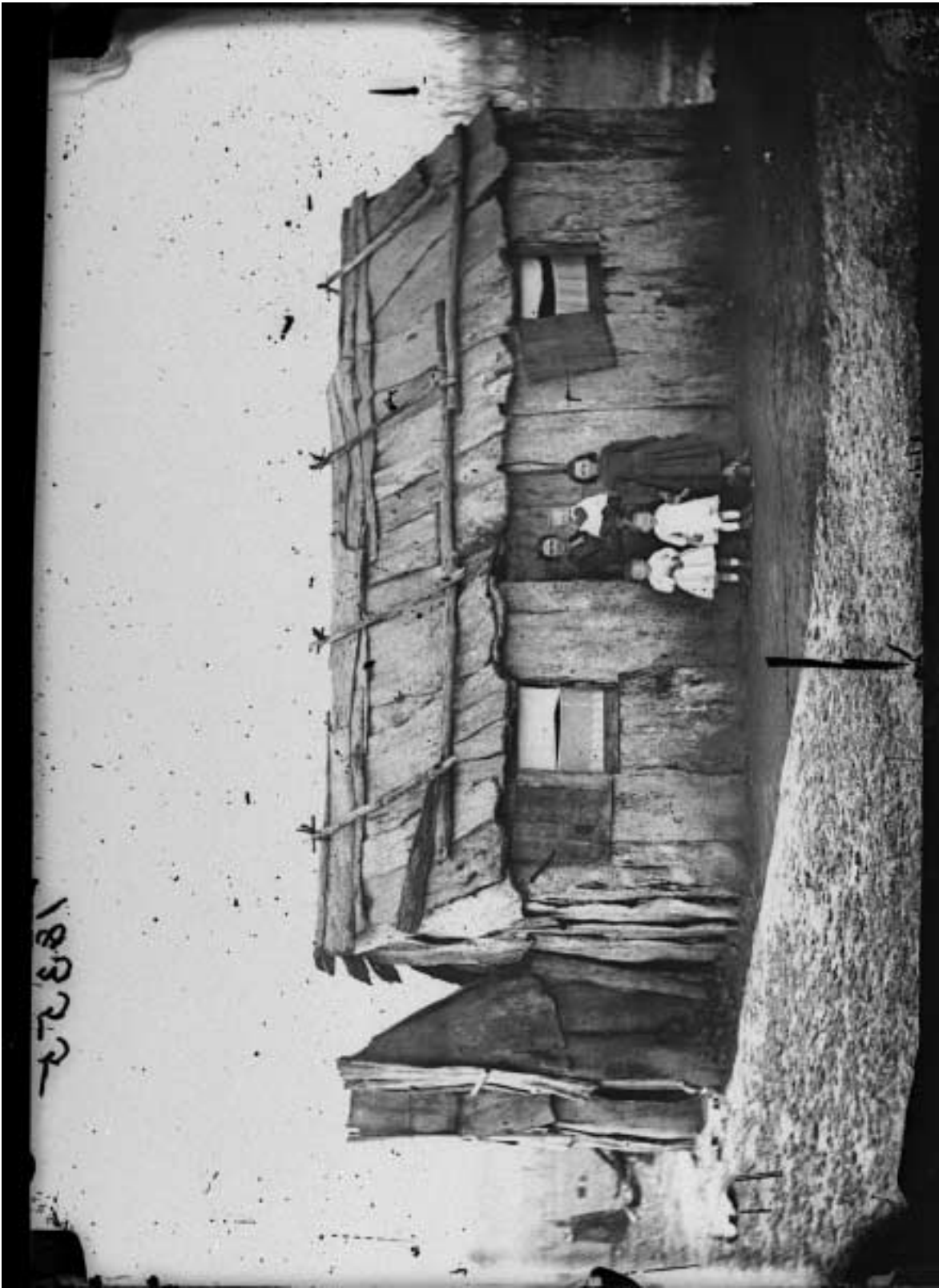
Mother & children outside their bark cottage, Gulgong area c. 1875